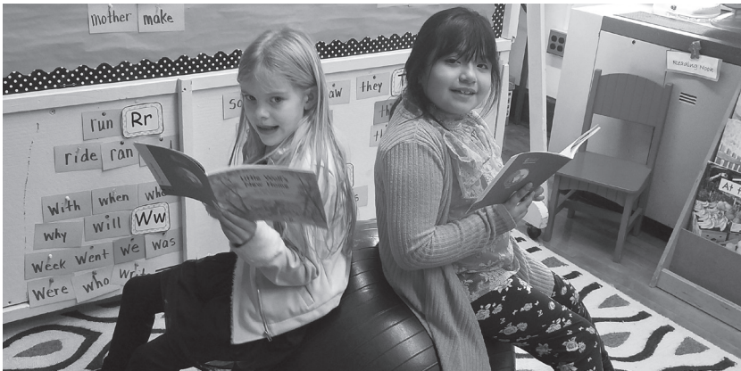
Traver Road Primary second graders practice guided reading in a space that best supports their learning.