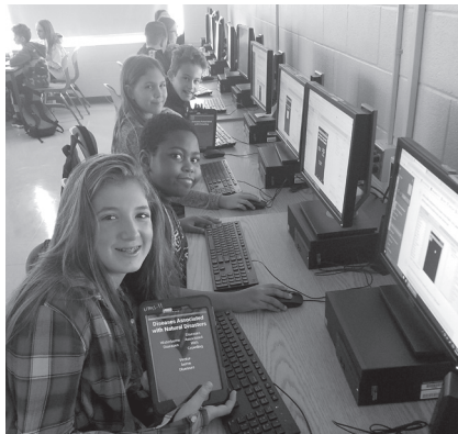
6th grade students are developing mobile apps to conquer real-world problems

WE BELIEVE that potential can only be attained through commitment, resilience, and high expectations.