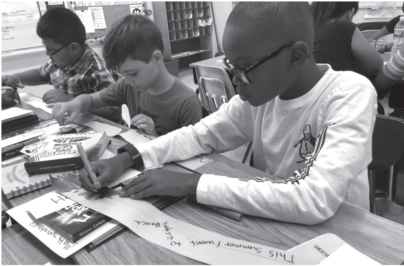
Titusville Intermediate School fourth graders write personal narratives as part of the Teachers College Units of Study writing curriculum.

The goal of the Arlington literacy program is to create flexible, resilient readers and writers who read and write for pleasure as well as for school. Teachers use strategies developed by the Teachers College Reading and Writing Project, along with other resources to help students expand and challenge their literacy skills. •